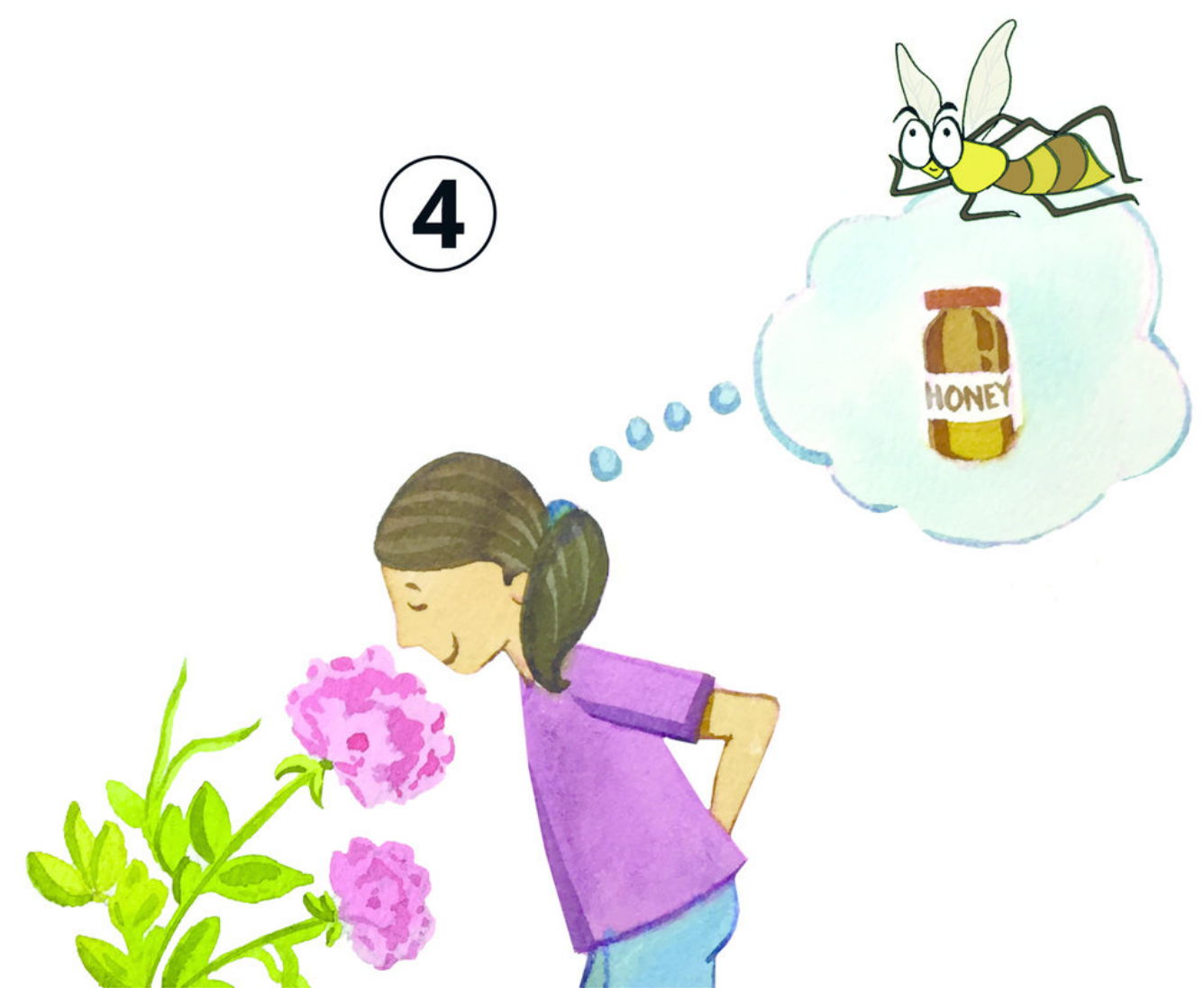
Deepa loves to have honey.