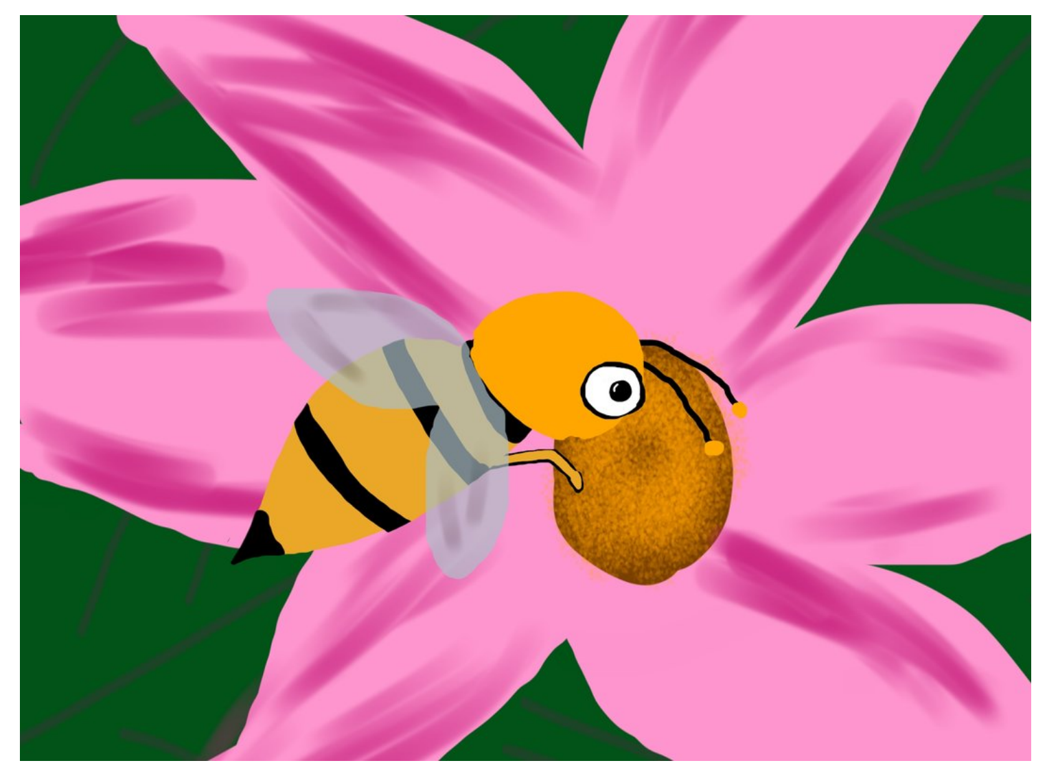
Beautiful flowers grew on the plants and bees started buzzing all the day!