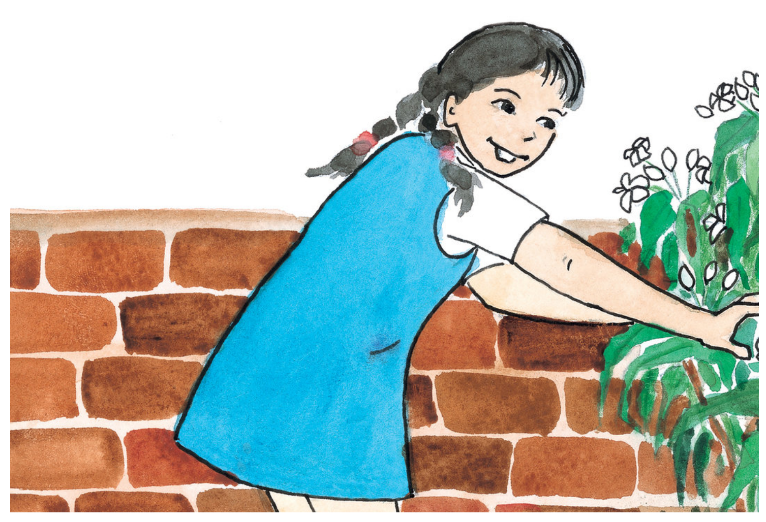
Deepa takes good care of plants and water them daily.